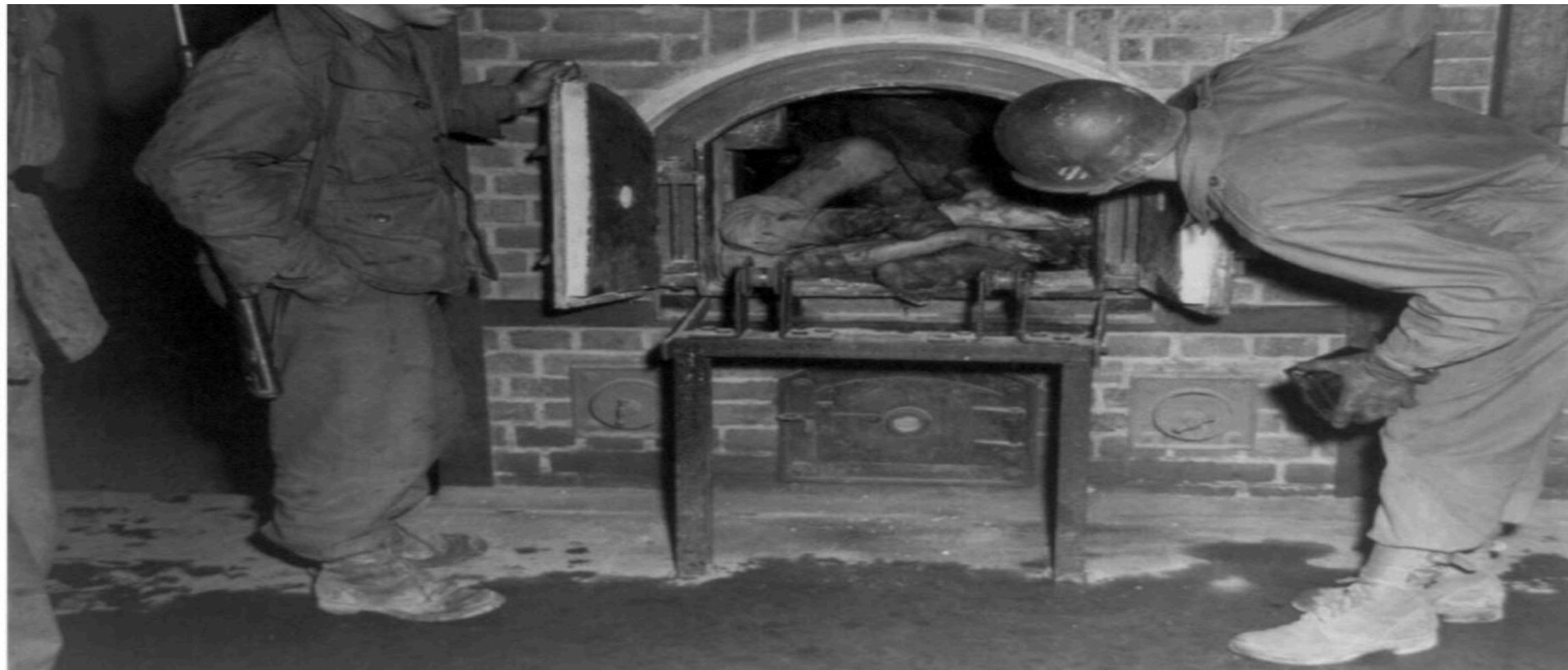
Three U.S. soldiers look at bodies stuffed into an oven in a crematorium in April of 1945. Photo taken in an unidentified