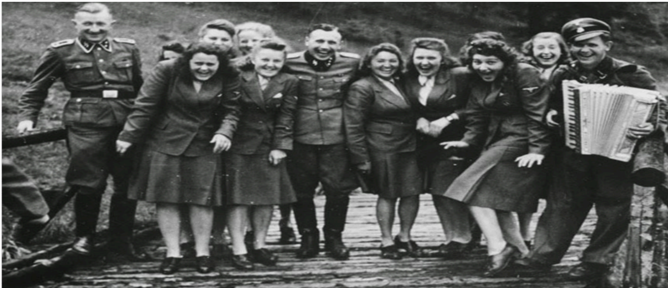
Laughter lines the faces of camp staff as they prepare for a sing-song.