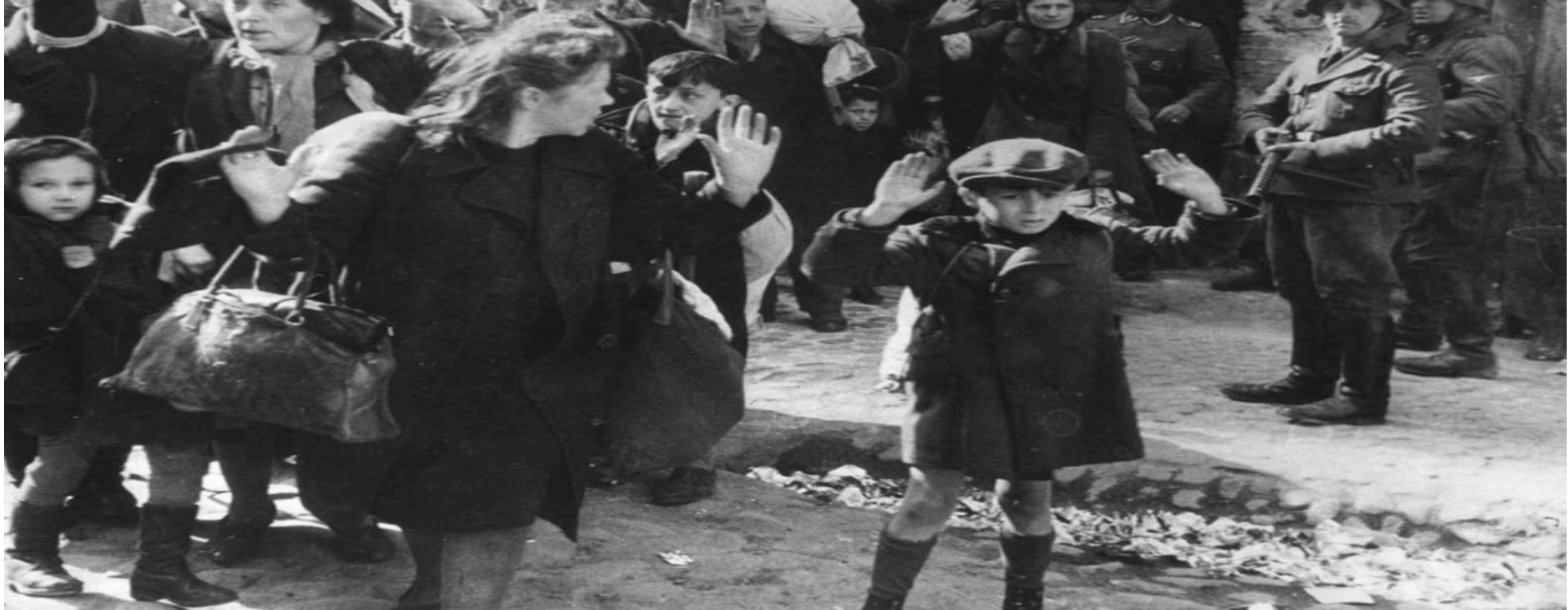
A group of Jews, including a small boy, is escorted from the Warsaw Ghetto by German soldiers in this April 19, 1943 photo. The picture formed part of a report from SS Gen. Stroop to his Commanding Officer, and was introduced as evidence to the War Crimes