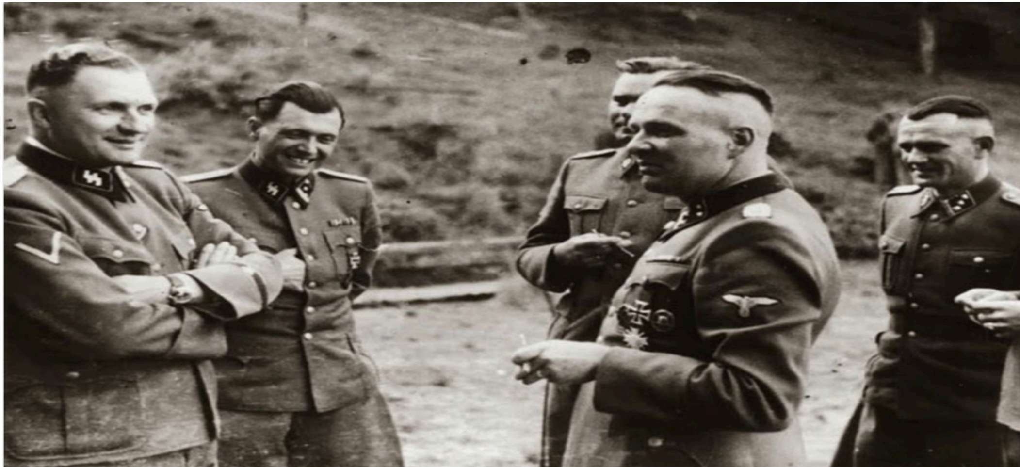
Taking a break. The second person is the notorious concentration camp doctor Josef Mengele (The Angel of the Death).