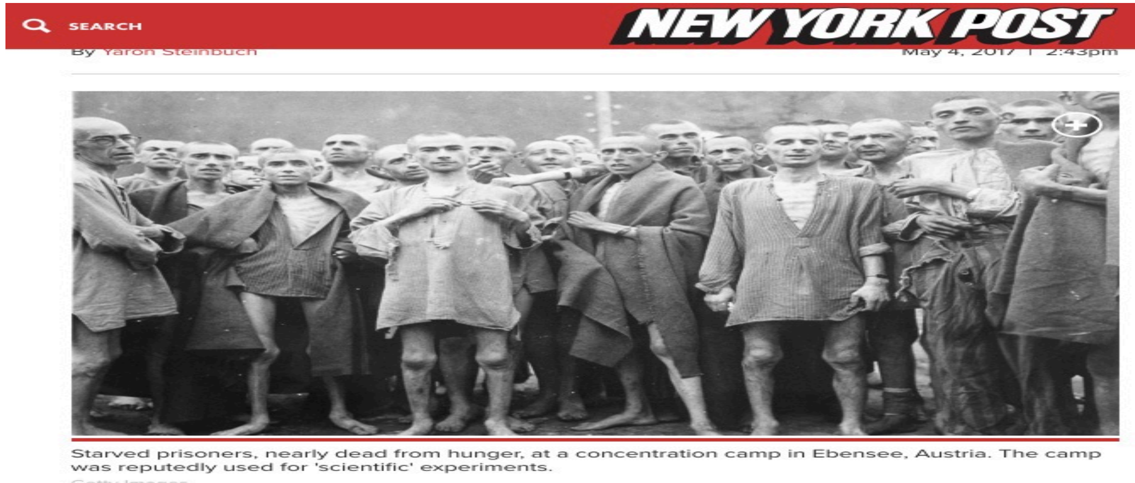
Starved prisoners, nearly dead from hunger, at a concentration camp in Ebensee, Austria. The camp was reputedly used for 'scientific' experiments.