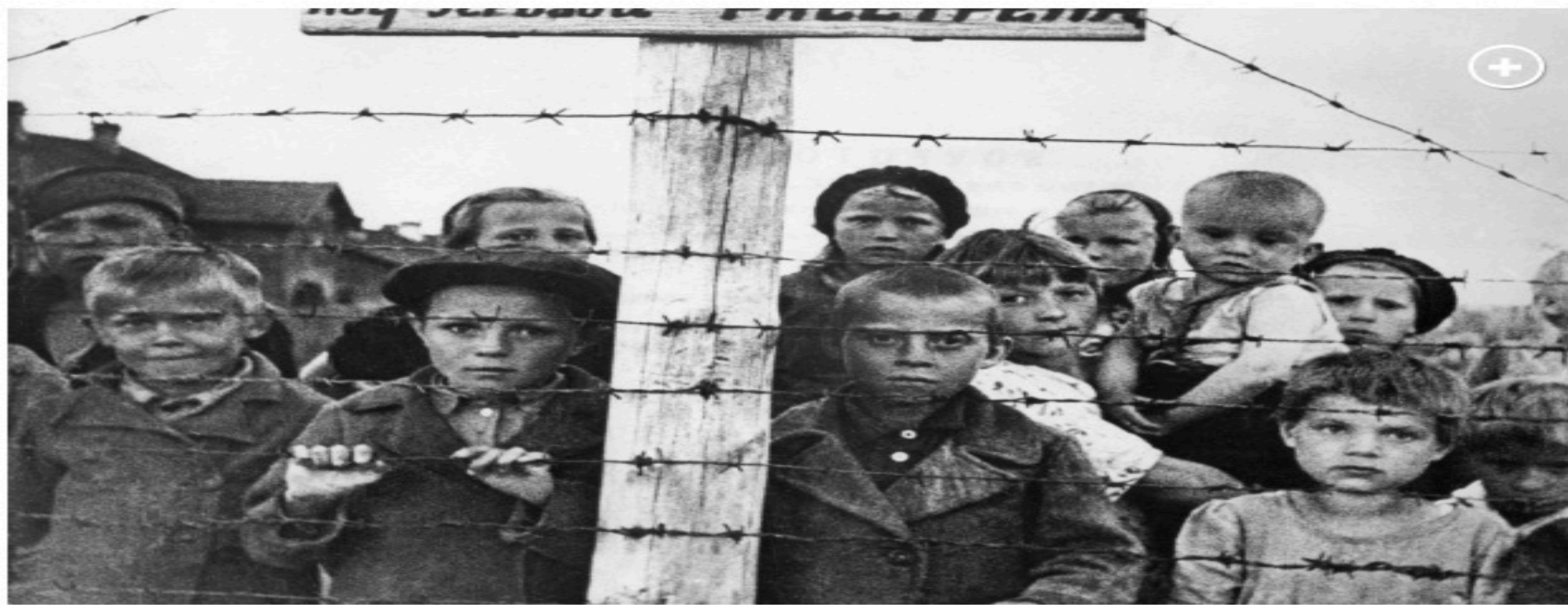
Children behind barbed wire in a German concentration camp in World War II