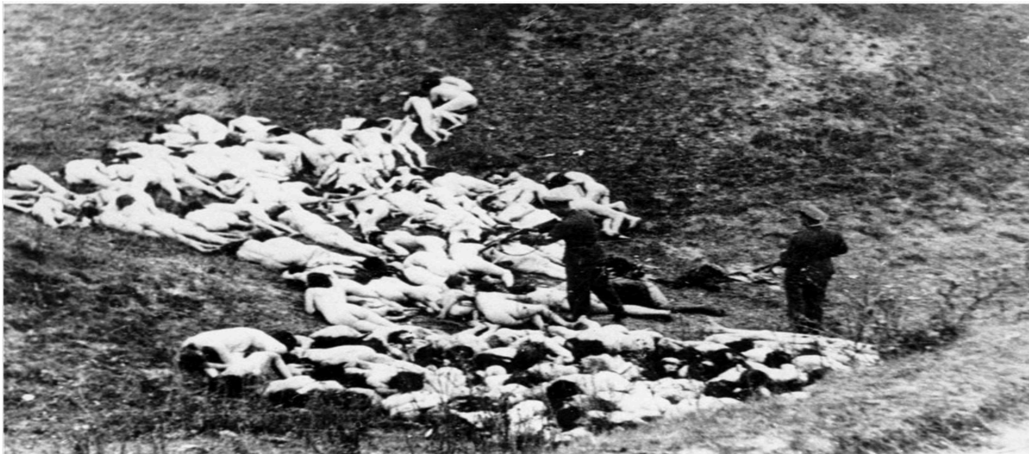
A German in a military uniform shoots at a Jewish woman after a mass execution in Mizocz, Ukraine. In October of 1942, the 1,700 people in the Mizocz ghetto fought with Ukrainian auxiliaries and German policemen who had intended to liquidate the population.