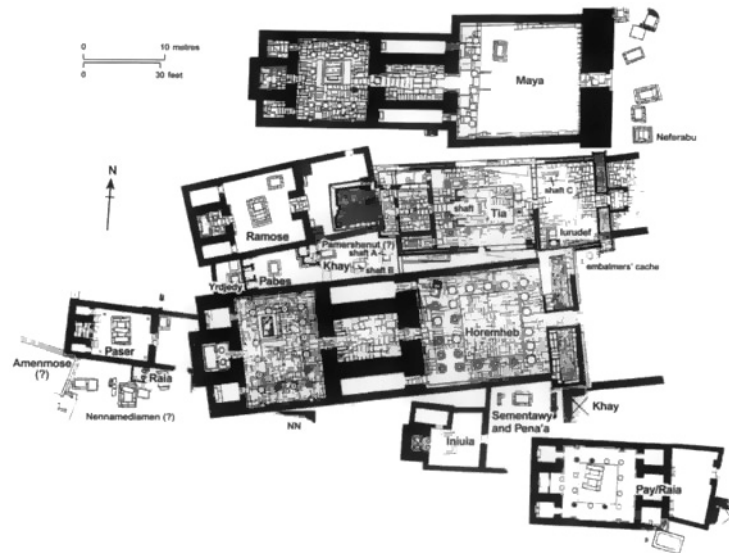
Plan of a group of tombs in the New Kingdom necropolis at Saqqara, where many important officials of the late 18th and 19th–20th Dynasties were buried

compared to the days before the Amarna Period. In these tombs, the solar symbol par excellence , the pyramid, previously a royal prerogative, sat on the roof of the central chapel, usually with a capstone (pyramidion) showing scenes of worship before Ra and Osiris. In the central chapel itself the main stele, the focal point of the cult, often showed a symmetrically arranged double scene comprising both of these gods seated back to back. Statues that had previously been typically placed in temples began to appear in private tombs, including images of various deities and naophorous statues that show the deceased holding a shrine with an image of a god.