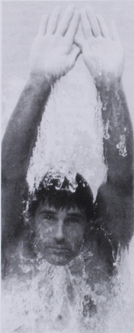
Fig. 1. A vertically rising person is a metaphor for emergence from general anesthesia.

tive euthanasia, 25 whereas others have recognized the inherent dangers of such an association. 26,27 In that one of the metaphoric roles of the anesthesiologist is as a guide to the patient through the perioperative period, it behooves us to ponder the implications of becoming the guide to death for the dying. Usually the hospitalized patient envisions the physician "as the sole barrier standing between himself and the Angel of Death," 28 not as the "Angel of Death" per se .