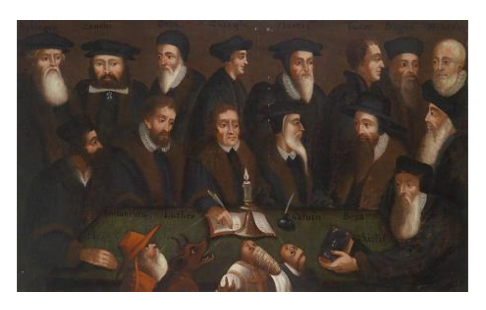
Reformation group portrait, 17th century.

The Protestant Reformation was not a liberal enterprise: it was the original 'fundamentalism', which is the derivation of the label 'fundamentalism' for Islam. The Christianity that was being 'reformed' was that of the Catholic Church, one that was based on Church authority and hierarchy. Worship is conducted through rituals and ceremonies celebrated by its priesthood, and claiming the authority to dispense salvation. The Reformation was to challenge these assertions of authority and uphold, instead, the authority of 'the Word', the Bible, literally interpreted and preached. The Word rather than the Church Fathers was the source of all authority and the individual believer was to read the Bible and follow it according to her conscience. Salvation was by divine grace and not by authoritative dispensation via a priest. As such, it dispensed with elaborate ritual and ceremony, images and tunes, considered as heretical (note the parallels with Salafi Islam), in favour of an austere preaching and worship, based on the literalism of reading the scriptures in the vernacular languages. Hellfire was the sanction against sin, and salvation was by seeking divine grace, and not by priestly dispensation. When Protestants ruled, as in Calvin's Geneva or in the Lutheran principalities, they instituted stern punishments for sin and heresy.