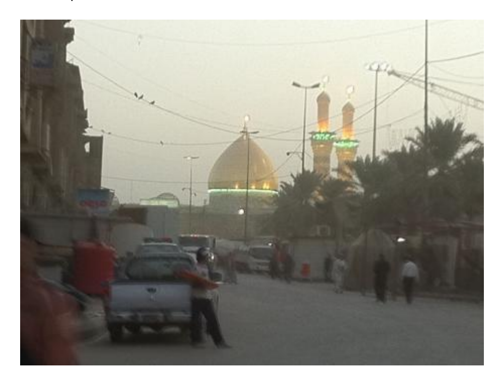
Karbala shrine, 2011.

mounting dominance and interference of the European powers (Britain and Russia) in the country. The intellectuals had nationalist and modernist objectives: progress, legal reform, rational administration and national assertion. Bazaar merchants threatened by expansion and privilege of foreign finance and commerce, utilising the arbitrary powers of a bankrupt monarchy. The clerics were primarily concerned by European dominance and the ideas that came with it, threatening their controls over law, education and public life.