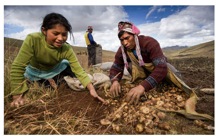
Climate change threatens yields in Potato Park, a farming association near Cuzco, Peru.

To reap bigger harvests, farmers will have to manage many risks, including disease.