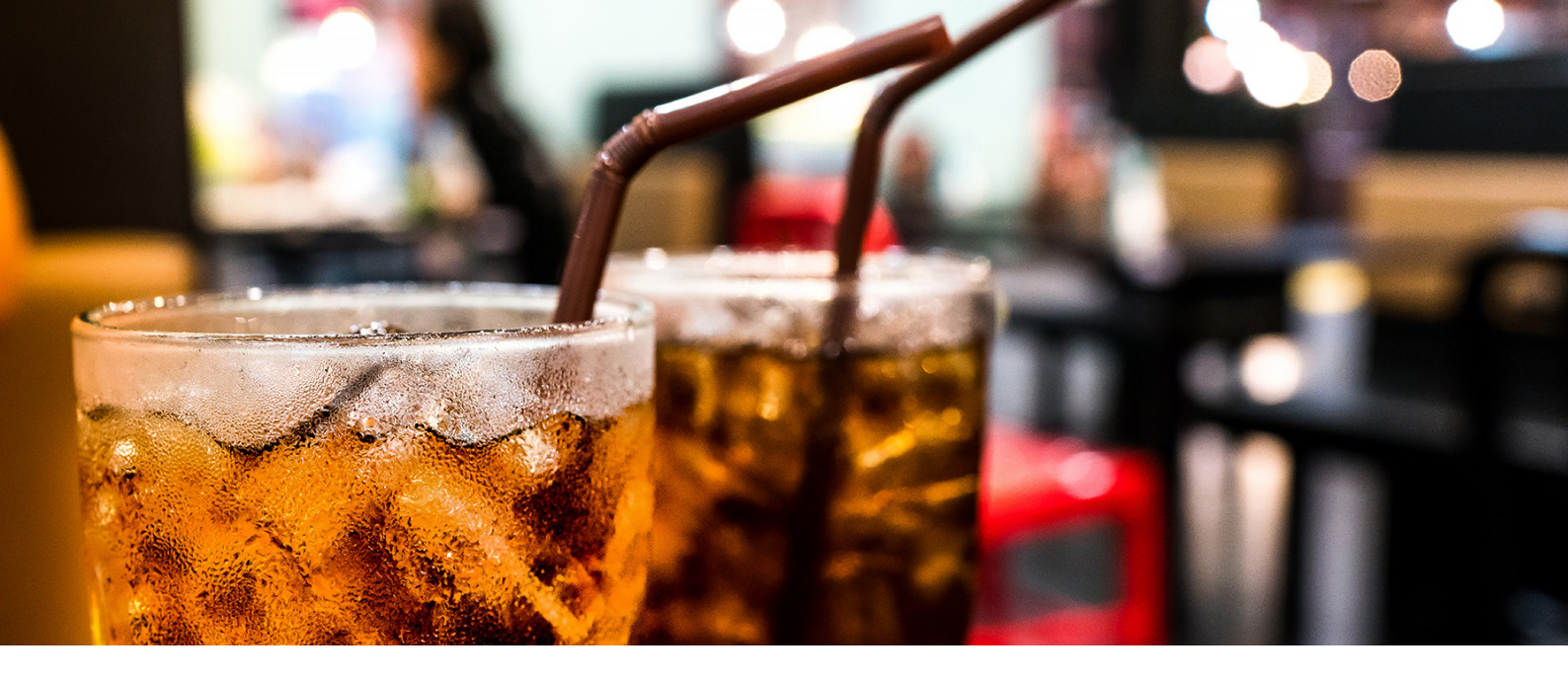
Top 10 Soft Drinks Brands Worldwide, by Key Regional Rankings