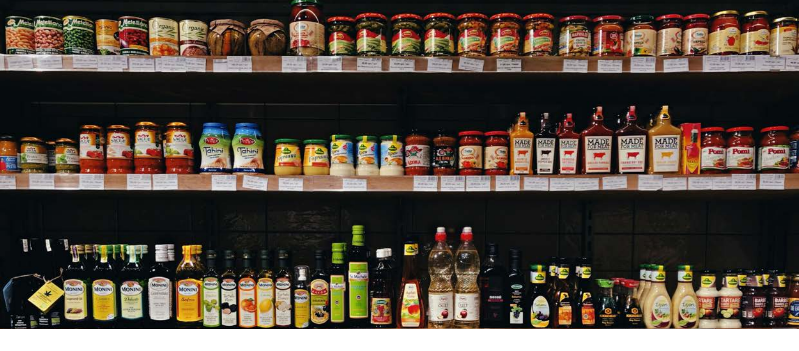
Top 10 Packaged Food Brands Worldwide, by Key Regional Rankings