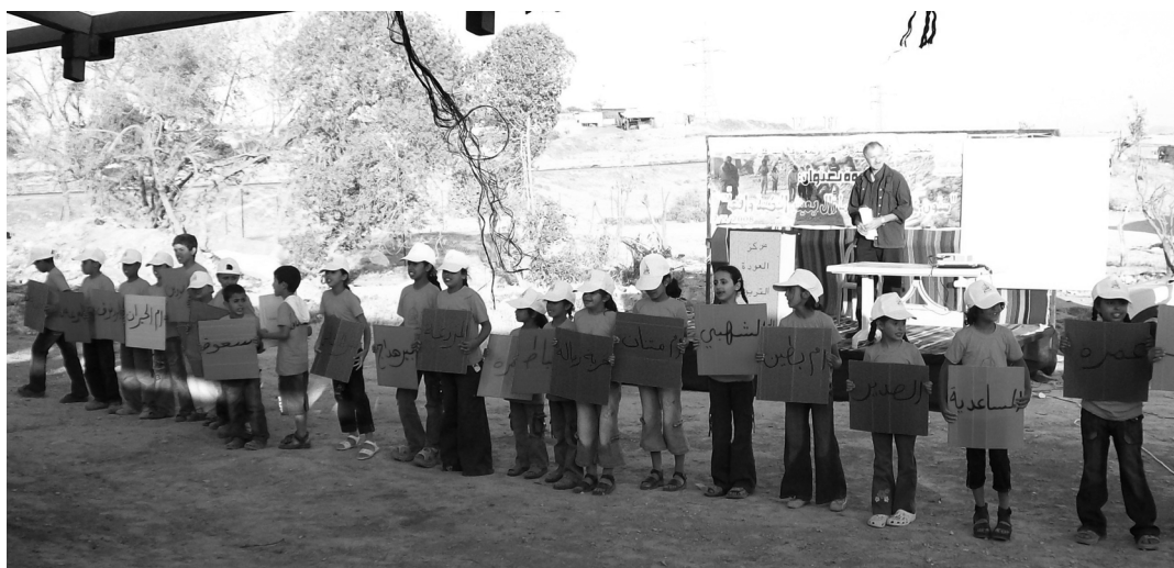
Figure 5 Day of Nakbah commemoration, al-Qrein, May 2008.