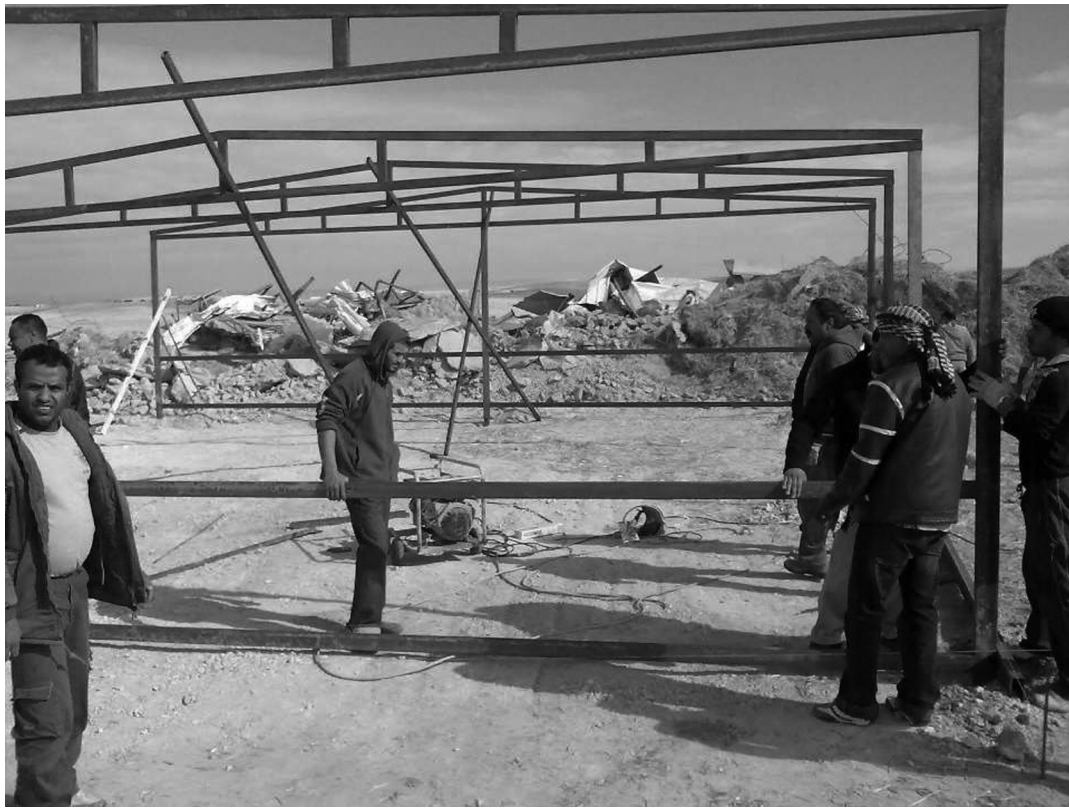
Figure 1 Rebuilding the mosque, Wadi al-Na'am, January 2009.

surrounding Jewish communities and other Palestinian communities known in the Naqab region as 'Northerners'. 1