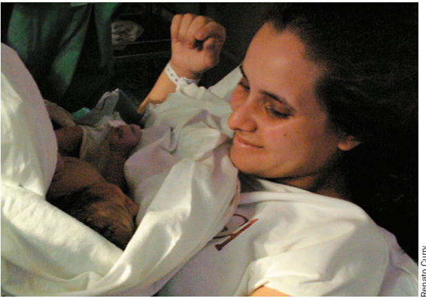
Figure 2: Mothers receive their babies for early skin contact and breastfeeding immediately after delivery in a humanised public maternity ward in Sâo Paulo, Brazil.<sup>1</sup>

But training is not enough; working conditions need to be improved so that staff have the time and privacy necessary to attend to patients properly, and have service training, access to laboratory services, treatment, and drugs. Managers should be active in identifying abusive staff, complaints should be investigated, and action taken immediately. Systems need to be created and well publicised, perhaps through an ombudswoman, that actively encourage patients to complain-especially patients who are poor, illiterate, or disempowered. The partnership with organised social movements to improve maternity care locally and globally should be an important step. Effective disciplinary action needs to be taken against staff who abuse patients, and colleagues who act as whistle blowers in this respect need to be protected. Societal interventions designed to reduce overall levels of violence and improve the status of women could also contribute towards more respectful relationships within health-care facilities.