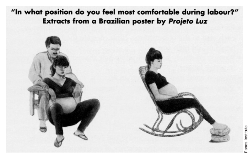
Figure 1: Poster from a campaign to change childbirth practices, particularly routine forced immobilisation of women during labour and delivery

babies as well as themselves, and interpret it as a sign that staff do not care or are acting unprofessionally. In a South African study in which expectant mothers were interviewed,6 most women expressed perceptions of neglect by midwives. The study6 used ethnographic methods to analyse obstetric public health-services in a relatively well resourced part of South Africa. The women described nurses who told them that they did not want to be bothered by women who felt the urge to push because they were sleeping, watching television, or talking among themselves and as a result, several of the women gave birth with no professional care. A similar problem was reported in Kingston, Jamaica: 65% of births at a large Kingston hospital were not attended by a physician or midwife and women complained about staff indifference.3 In Nigeria,8 women asserted that they were rarely physically examined during labour and were not attended by staff qualified for that purpose.