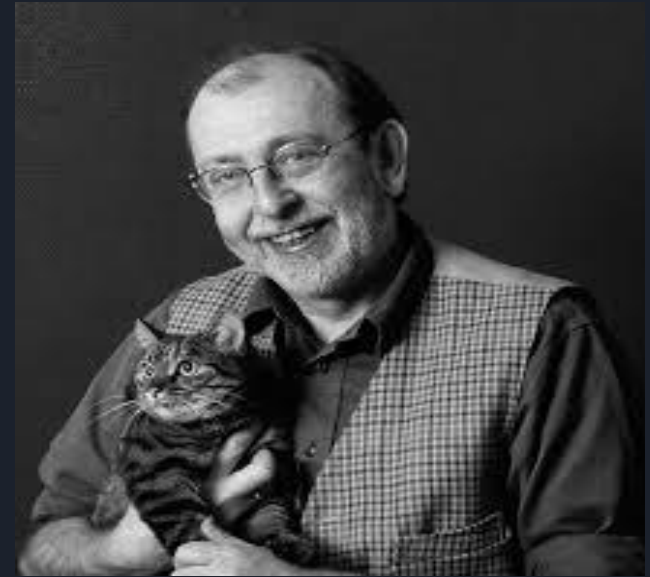
Alain de Benoist (74 years old and an idiot)