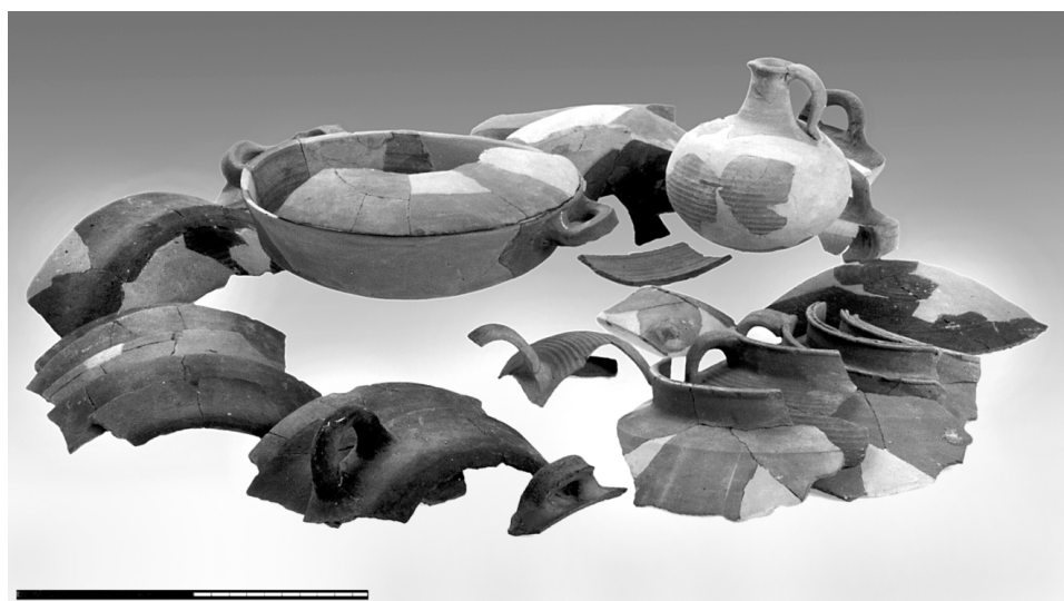
Fig. 7. Selected pottery finds from Stratum Roman 2b (Locus 1937) ( culina )

Following a devastating earthquake, the entire complex suffered sudden and violent destruction. Ashlars fallen from the surrounding walls were found in practically all the rooms. In the northern corridor (Loci 1902 and 1761), the northern