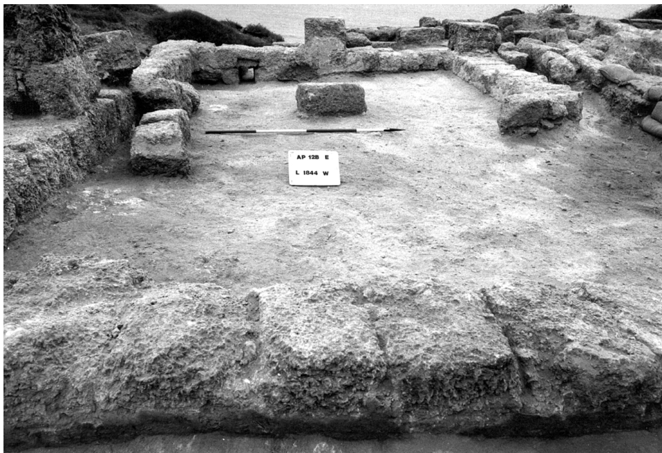
Fig. 4. Peristyle courtyard (view to the west)

The centre of the building consists of a peristyle courtyard (Locus 1844) surrounded by square piers supported by a stylobate built entirely of headers (fig. 4). Of the original ten piers that surrounded the courtyard, only the lower parts of four are preserved. They are built alternately of headers and stretchers with parallel square cavities — likely for the insertion of horizontal wooden beams. If so, the passage from the courtyard to the surrounding corridors could have been blocked when necessary. The building stones of the piers and stylobate are on average 0.29–0.30 m. in width, 0.43–0.44 m. in height, and 0.59–0.60 m. in length. These measurements seem to reflect the same modular unit of the Latin