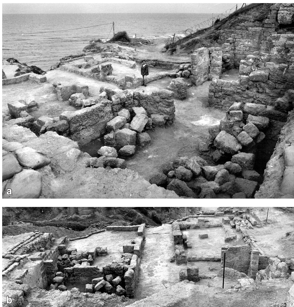
Fig. 3. Roman villa maritima : a) view to the north-west; b) view to the west

The first piece of evidence is its location, almost at the top of the seashore slope and above a small ravine that probably served as the main descent to the harbour. To construct the building, the slope's natural sandstone rock was hewn to a depth of more than 3 m. on the eastern side, and then levelled horizontally towards the west (fig. 2). Thus, a flat, rocky surface was obtained, with a maximum distance of 21.50 m. from north to south and c. 24 m. from east to west. The surface of the floors was at an average height of 26.20 m. above sea-level. The