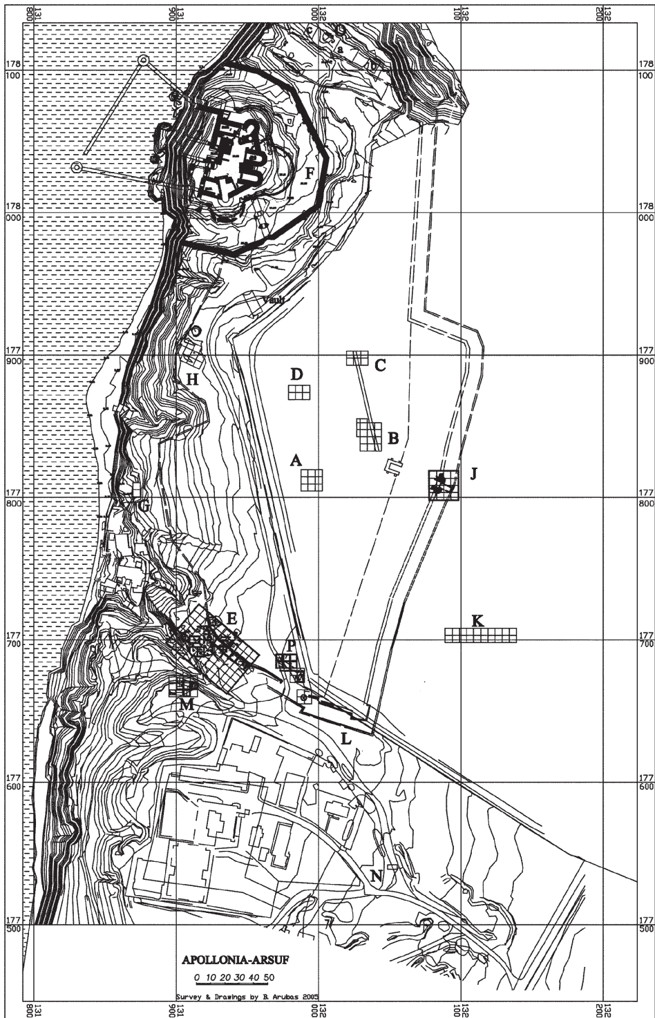
Fig. 1. Site plan