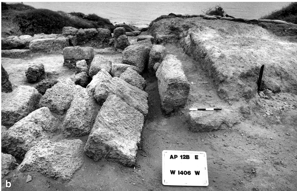
Fig. 8. Earthquake collapse of walls; a) Locus 1777 (view to the south); b) Locus 1761 (view to the west)