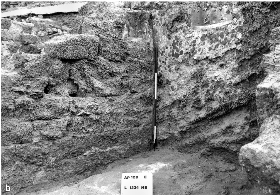
Fig. 5. Roman villa maritima ; a) long corridor (Loci 1851/1768); b) plastered arched niches in its eastern end