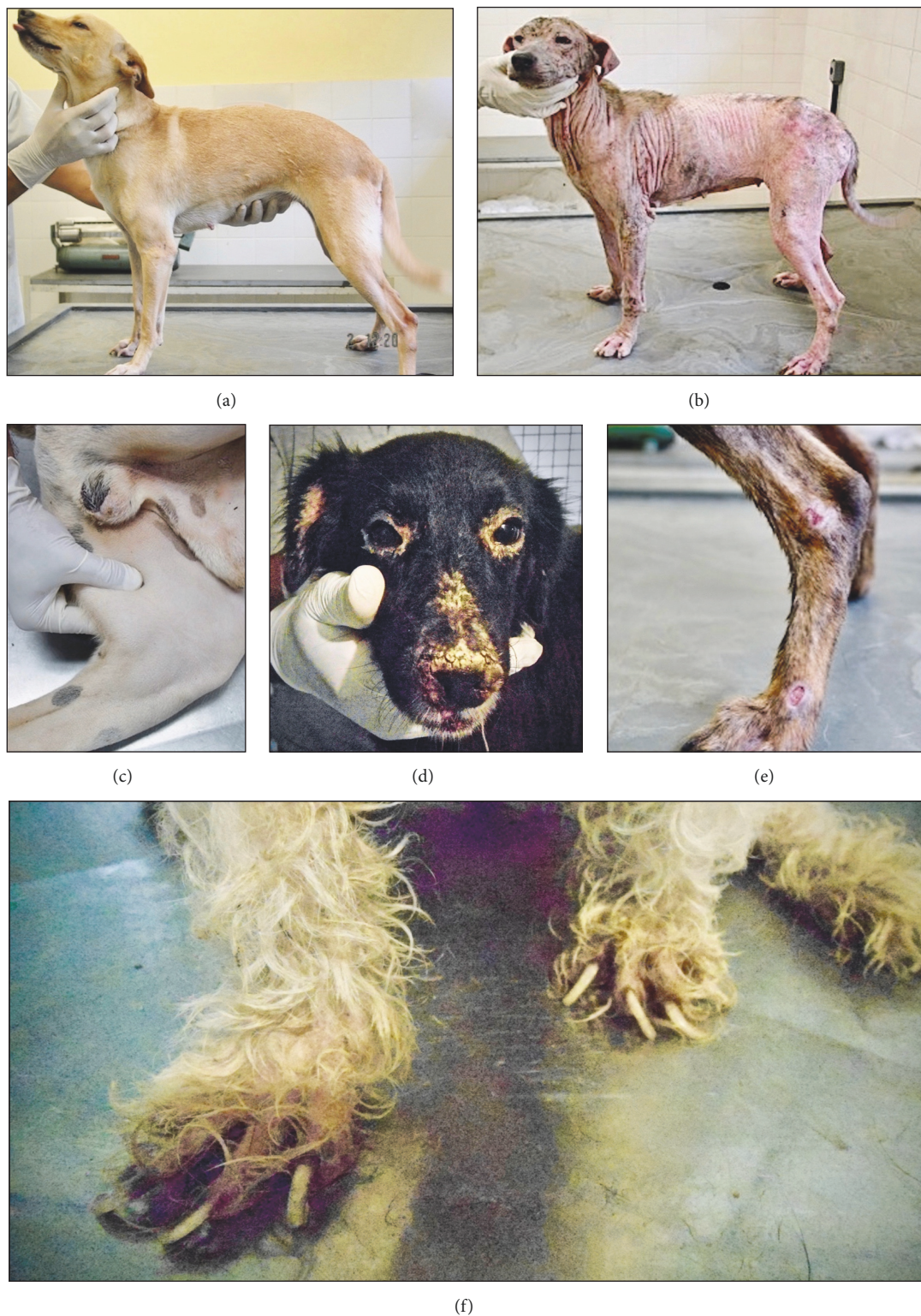
FIGURE 1: Clinical manifestations of dogs naturally infected with Leishmania (Leishmania) infantum : (a) asymptomatic dog (apparently healthy but infected); (b) generalized nonpruritic alopecia and multiple other dermatological abnormalities; (c) popliteal lymphadenomegaly; (d) bilateral blepharitis and extensive muzzle involvement with marked exfoliative ulcerative lesions; (e) ulcerative lesions at the bony prominences of the hind limb leg; (f) onychogryphosis.