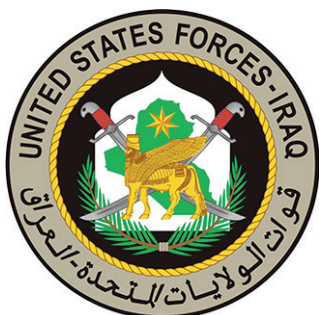
Fig. 2. Logo of the United States Forces – Iraq.

The relationship between the destruction of a nation's past and the destruction of its future is foregrounded in the commentaries of a number of Syrians, such as Amr al-Azm, a pro-opposition former Syrian antiquities official. For him, once the conflict is over 'Syrians ... will look to common denominators that helps them identify what makes a Syrian Syrian – the incentives that make them live together. And they're going to look for the symbols that help hold their society together, and cultural heritage in general is one of the few areas they do agree on, that they can rally around and use as a focal point to rebuild and restructure their lives' (Shaheen 2015). For Bokova as well as al-Azm, the destruction of cultural heritage puts reconciliation and