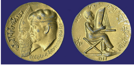
Fig. 4. Medal with the emblem of the 1987 Babylon International Festival including images of Nebuchadnezzar and Saddam Hussein.