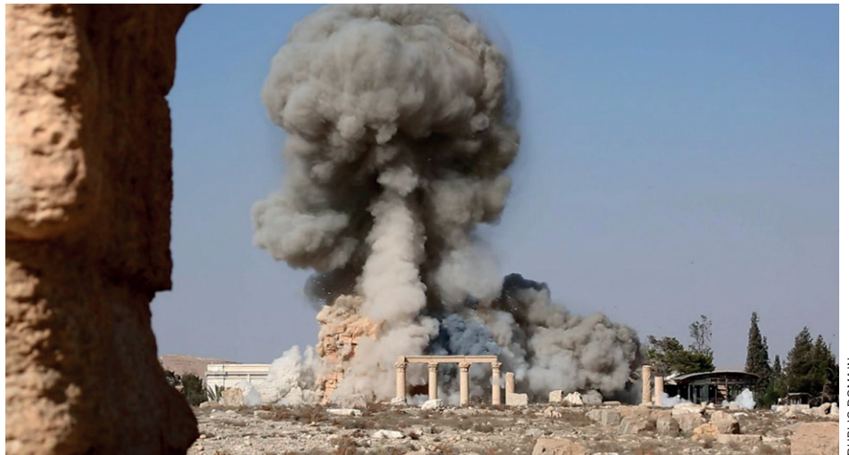
Fig. 1. Destruction of the Baalshamin temple in Palmyra.

Instead, I offer here a different reading that highlights the long-standing link between archaeology and (empire and) state building in the Levant. I argue that we cannot understand IS 'spectacles' of destruction (Harmanşah 2015) without unravelling Near Eastern archaeology's deep entanglement with both the history of Western colonial and neocolonial interventions in Iraq and Syria and the political projects of the local variants of Arab