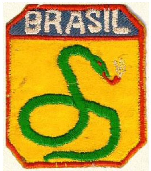
Figure 2. Brazilian Shoulder Patch

The shoulder patch created and adopted by BEF was designed to address upfront those people that had not believed in Brazil's capacity in sending a force to fight for the Allies. The patch also signified the valor and the courage of the BEF soldiers. The "smoking snake" became a symbol of the BEF, and its soldiers were very proud in wearing a patch that could identify them among the 5th United States Army. Figure 2 depicts the Brazilian shoulder patch.