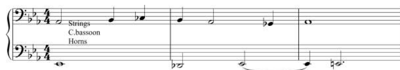
Example 1. Opening Adagio (bb. 1-3)

The opening Adagio presents a short theme in a dark atmosphere that seems to foretell a dramatic music. In fact, it is a prelude to the Prelúdio that contributes to the darkening scenario to come, and which will be evoked again just before the recapitulation (Example 1). 14