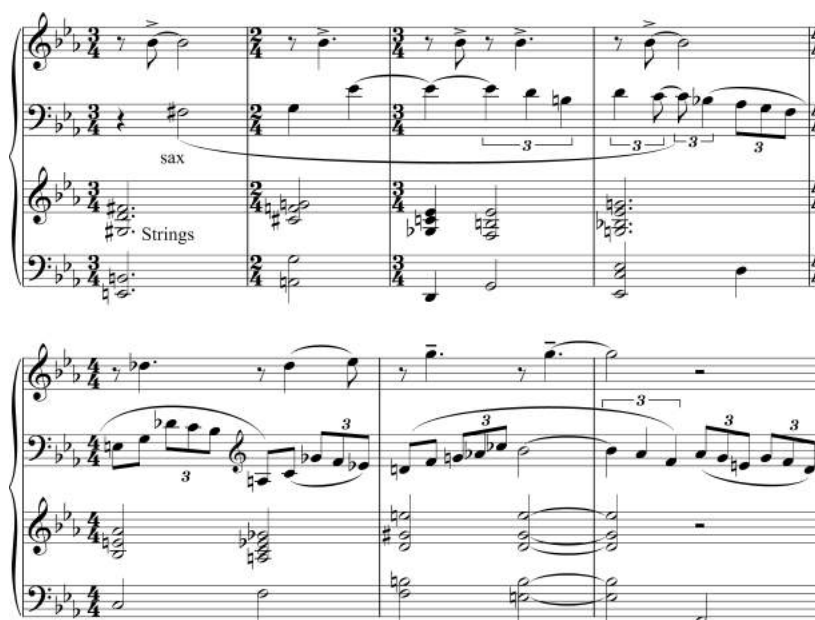
Example 2. Section A (bb. 4-10)

This is a two-voice phrase in A \flat minor: the melody in the upper voice resolves around A \flat and the lower voice around E \flat , but it ends a half step higher, destabilizing the structure, as if it were a VI of A \flat minor. This little half step at the end of a phrase or theme, which completely shifts the sense of the music, is an element Villa-Lobos will use again in this piece in a very meaningful way, as we will see. For now, we retain the sober and obscure character of this short Adagio, with the break at the end that provokes instability. In fact, this enigmatic Adagio enacts a tragic atmosphere that imprints some darkness on the following scenario: the exposition of the first theme by the tenor saxophone. The harmony here presents many dominant seventh chords in a cycle of fourths in the strings (E A D G C F E) as the harmonic basis for a very prominent saxophone solo (Example 2).