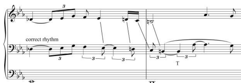
Example 4. Section A (bb. 12-3) (modified version)

The next figure (Example 5) shows other timbre transfers in the Canto do Capadócio : at bar 15 from saxophone to trombone. The melodic curves and the fermata climax point to a lyricism from the old Seresta singing style, an época de ouro topic. Trombone and saxophone descending zigzags are scored with an ascending harmony in the strings. This sliding trombone has a particular place in Brazilian musicality: it is a brejeiro effect of looseness that constitutes what one may call Brazilian trombone, an important character of the Gafieira bands that would appear in the 1940s. From then on, the trombone brasileiro , with its sliding melodies and metallic sound, has played an important role in samba and choro music. 19 Example 5 below shows the score from bars 14 to 26, the end of this first exposition. The trombone drops out of the scene at bar 21, leaving the end of the first exposition with the cellos in the low register, recreating the dark and dramatic aura from the Adagio. In this obscure moment, one can hear two allusions to the Tristan motive in the high register by the violins.