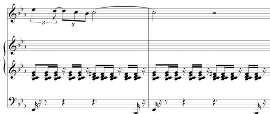
Example 7. Section B (excerpt: bb. 55-64)