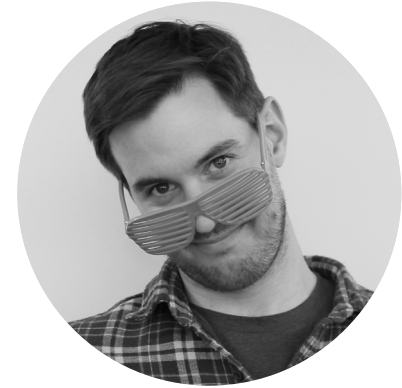
Figure x.7 Accuracy and Rights