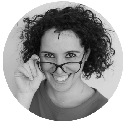
Figure x.8 Homework