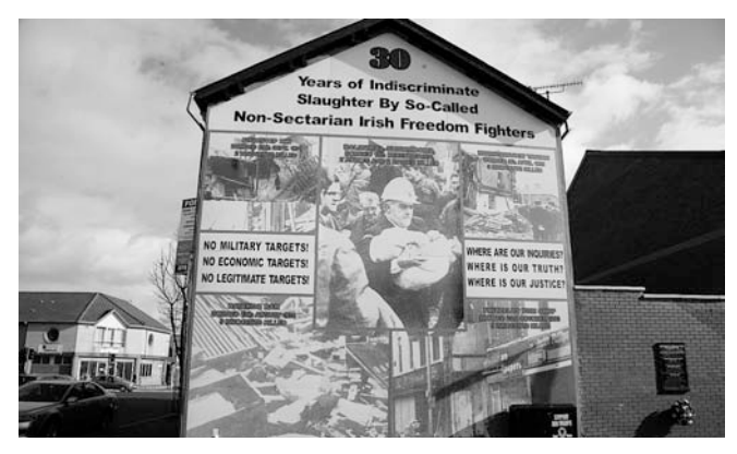
Protestant Mural on the Shankill Road, © CAIN (cain.ulst.ac.uk).

January 2004. The mural portrays five major IRA bomb attacks that struck the Protestant community of the Shankill Road area in West Belfast (in one, the Shankill Road bombing of October 23, 1993, nine Protestants and one of the IRA men carrying the bomb lost their lives in the attack on Frizzel's fish shop). The mural includes two straightforward messages from the Protestant community for the IRA and the British government: "No Military Targets, No Economic Targets, No Legitimate Targets" and "Where are our inquiries? Where is our truth? Where is our justice?"