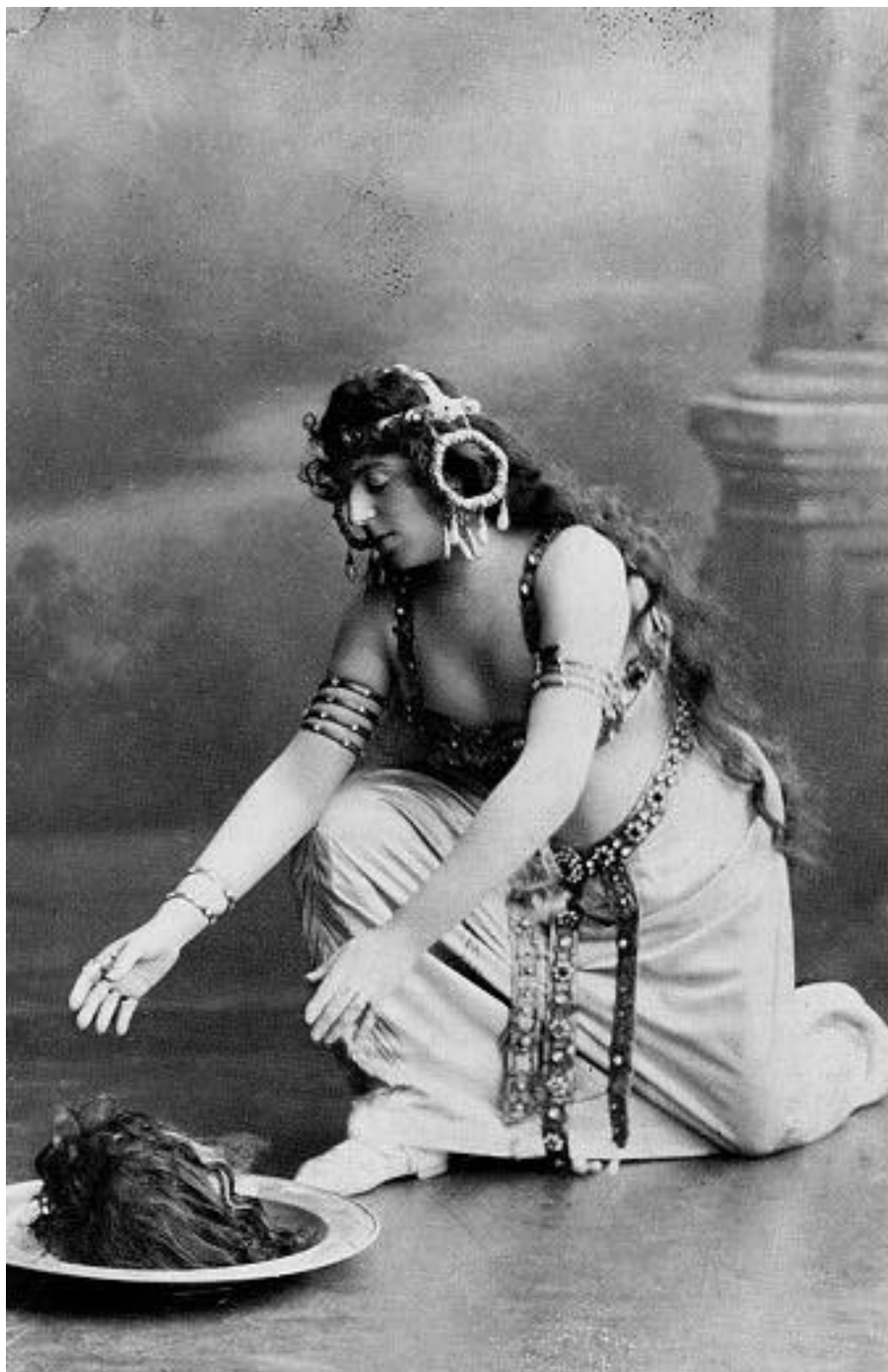
Figure 1. Oscar Wilde as Salomé with the head of Jokanaan