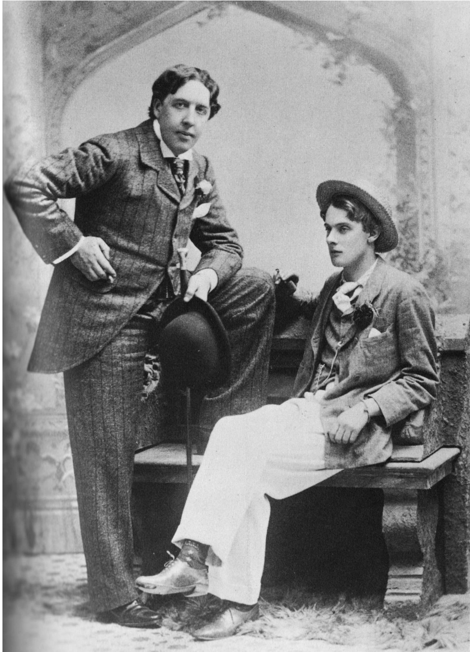
Figure 3. Wilde with Lord Alfred Douglas (Bosie) in 1893