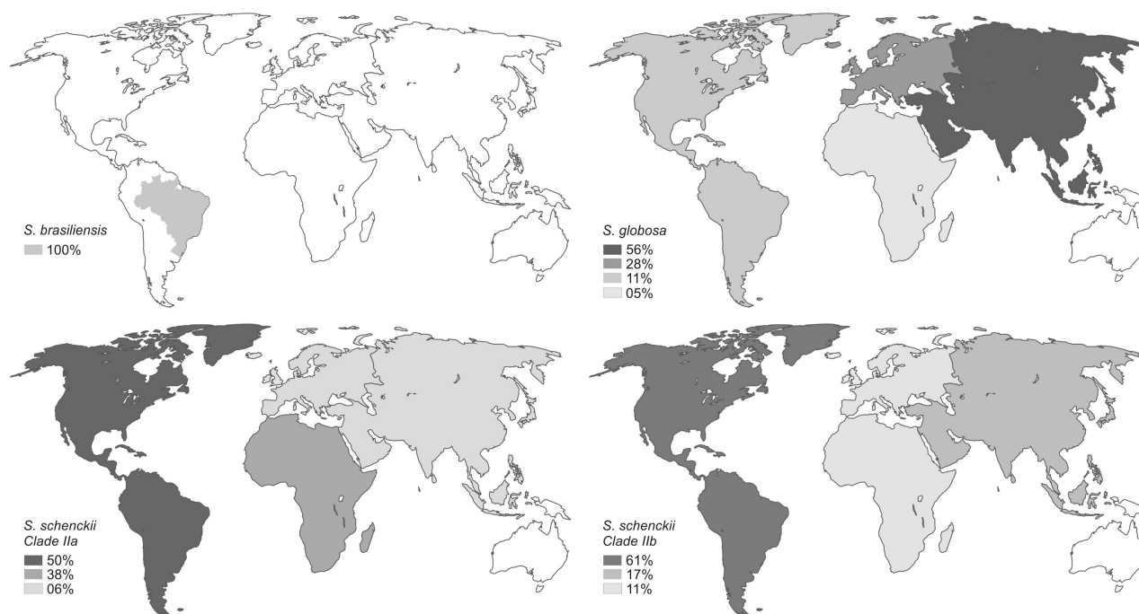
Figure 2. Global distribution of Sporothrix brasiliensis , S. globosa , S. schenckii clade IIa, and S. schenckii clade IIb. (Adapted from Zhou et al., 2013)