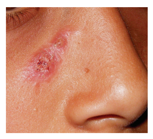
FIGURE 2: Fixed cutaneous sporotrichosis. A crusted/verrucous plaque develops at inoculation site, seen here over face of a child.

papulopustules, nodules, or verrucous plaques and occasionally nonhealing ulcers or small abscesses. The lesions may resemble keratoacanthoma, facial cellulitis, pyoderma gangrenosum, prurigo nodularis, soft tissue sarcoma, basal cell carcinoma, erysipeloid, or rosacea [14, 36, 37]. This form is considered to occur usually among hosts having high resistance wherein minimal lesions may subside spontaneously or persist exceptionally if not treated, and responds better to treatment [15, 38].