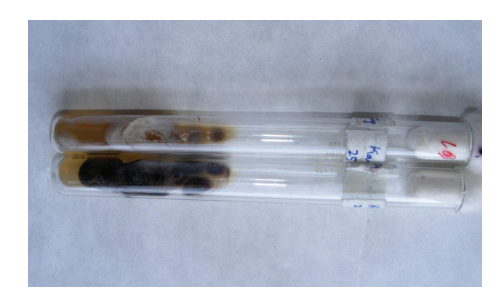
FIGURE 3: Sporothrix schenckii colony on Sabouraud's glucose agar (SDA) at 25°C. Initial cream color turns brown black as it matures.

4.2. Culture and Identification of Causative Fungus. The various Sporothrix species appear similar in morphology, but only S. schenckii is pathogenic to humans. S. schenckii can be grown from skin biopsy or other clinical samples (sputum, pus, synovial fluid/biopsy, bone drainage/biopsy, and cerebrospinal fluid) on Sabouraud's glucose agar (SDA), brain heart infusion agar, or Mycosel at 25°C and the growth is visible in 3–5 days to 2 weeks [1]. Incubation of cultures at 37°C in blood glucose-cysteine agar or brain-heart infusion broth will produce its yeast form. The initial cream-colored colonies grown on SDA at 25°C are smooth and moist but turn brown/black after a few weeks due to melanin production that protects it from phagocytosis and killing by human monocytes and macrophages and extracellular proteinases (Figure 3) [57].