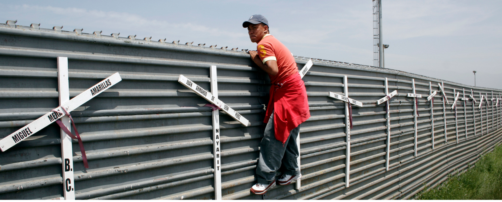
Migrant attempting to cross into the United States

policy emphasizes greater enforcement of immigration laws and increased efforts to dissuade irregular migration. This includes expedited processing and removals including deportations, or "repatriation." Enhanced border enforcement is another significant component focused on the U.S. –Mexico border as well as the Mexico-Guatemala border and borders within Central America.