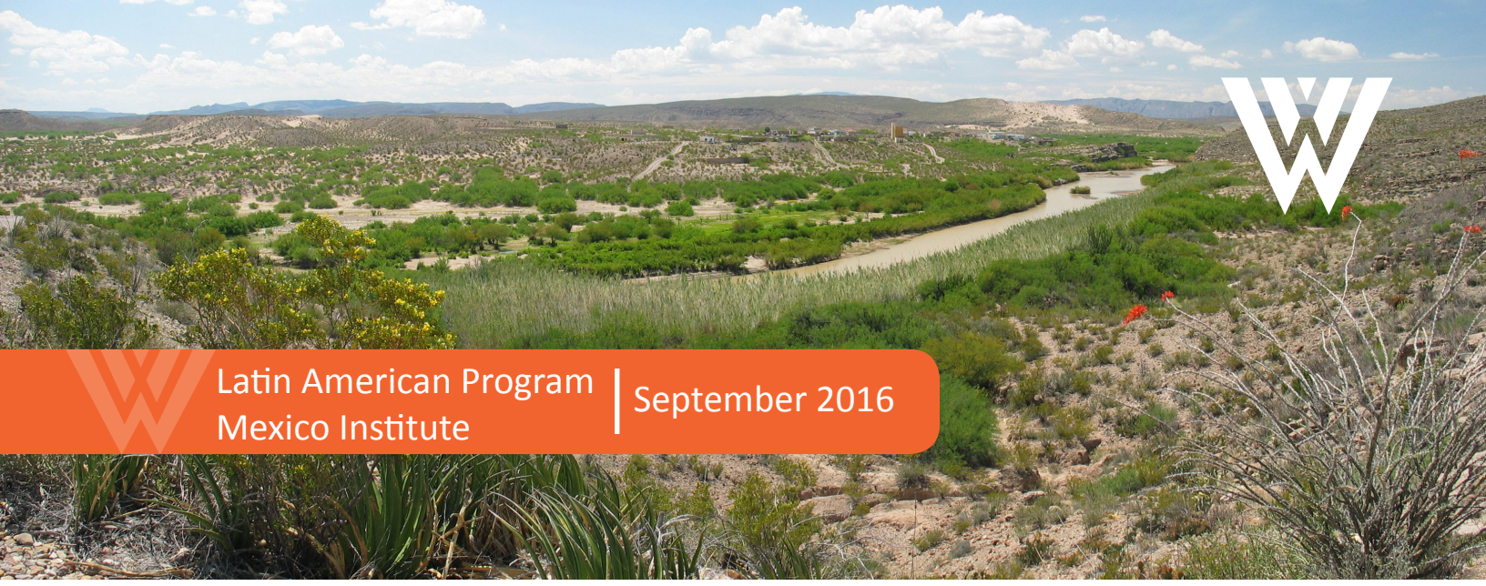
River Grande Valley, US-Mexico Border