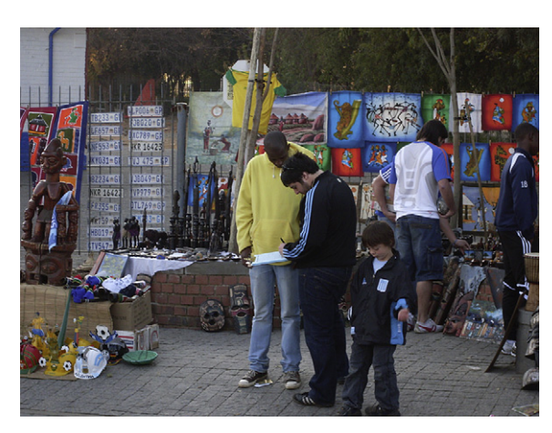
Fig. 3. Data collection.

from Kaplanidou (2007). The FIFA perception, revisit intentions, and word-of-mouth items were worded as statements asking respondents to agree or disagree on a five point Likert scale that ranged from 1 = "strongly disagree" \rightarrow 5 = "strongly agree". The familiarity questions were worded as statements asking respondents to state how familiar they were on a five point Likert scale that ranged from 1 = "not very familiar" \rightarrow 5 = "very familiar". The familiarity questions also contained a sixth anchor (i.e., "never heard of") in case the respondent was completely unfamiliar with any of the 'Win in Africa' programs. The caveat being that when individuals are aware of existing organizational programs and services, they will likely use this information to assess organizational messages. It is, therefore, important to distinguish between actual awareness and perceived awareness because the relationship to consumer attitudes will be linked to the former and not necessarily the latter. In addition, since all "never heard of" responses comprised less that 6% of the responses for a given item,