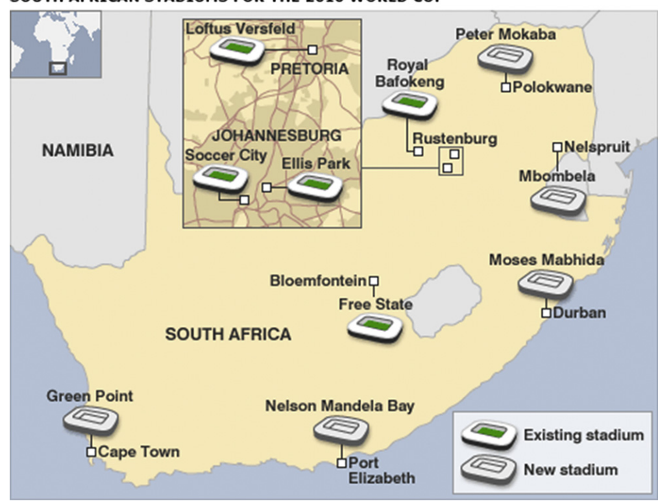
Fig. 5. Stadium Locations.

they were removed from the data set for the final analyses. The event image question was worded as a singular 'global' evaluation statement on a five point Likert scale ranging from 1= "very negative" \rightarrow 5= "very positive. This item was adapted from the destination image literature (see Baloglu & McCleary, 1999), under the assumption that mega-events (e.g., the FIFA World Cup) are tourist attractions.